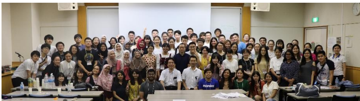
Picture with delegates