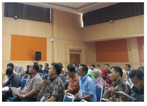
Audience from ITB faculty and students, Government representatives and high school teachers