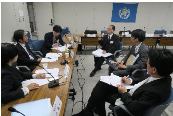
Group discussion on the research agenda