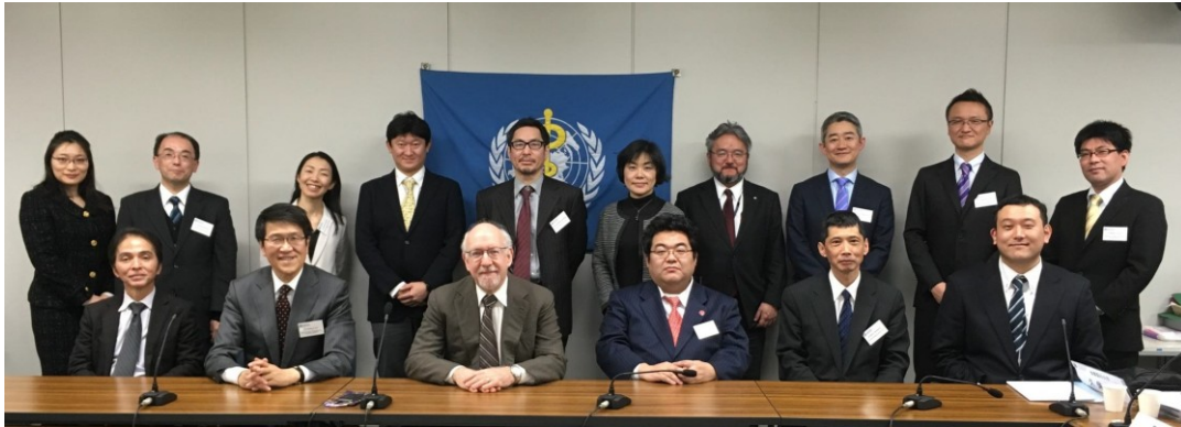
Multidisciplinary members of the consultation meeting

We will further promote this collaborative research initiative to establish better psychosocial response from acute to long-term phases after disaster. Since psychosocial impact of disaster strongly depend on the culture of affected people, the whole discussion and research process will be conducted in Japanese, but the output will be propagated to the world through WHO.