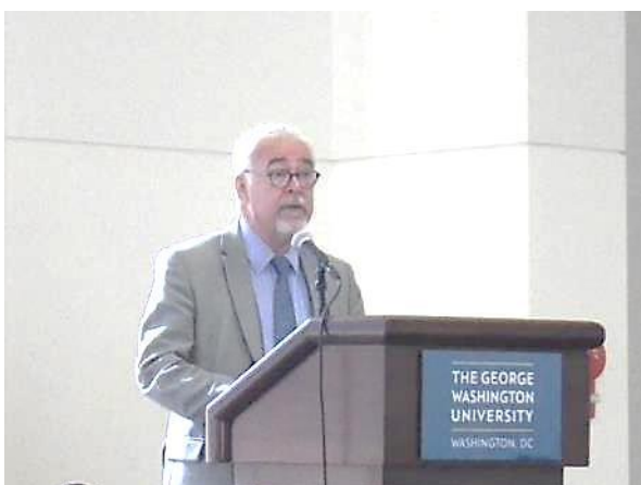
Key Note Address on the second day