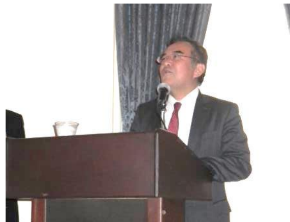
Minister of Economic Affairs Mr. Kanji Yamanouchi gives an address to welcome and support the symposium at Embassy of Japan to the United States.