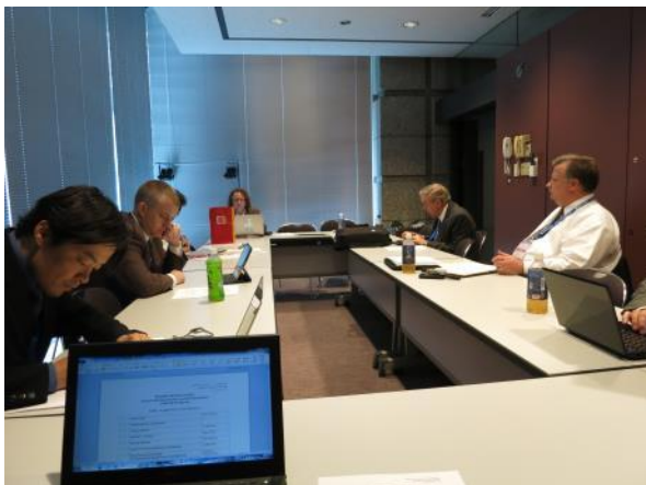
NRDCM business meeting

A sheet of inquiry that was approved by IRB were handed out to all participants of ACEM and will be translated and collected in all DMAT members to investigate the general consciousness of emergency medical workers about nuclear and radiological disaster.